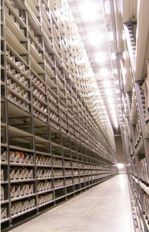
Legal Deposit in Offsite Storage