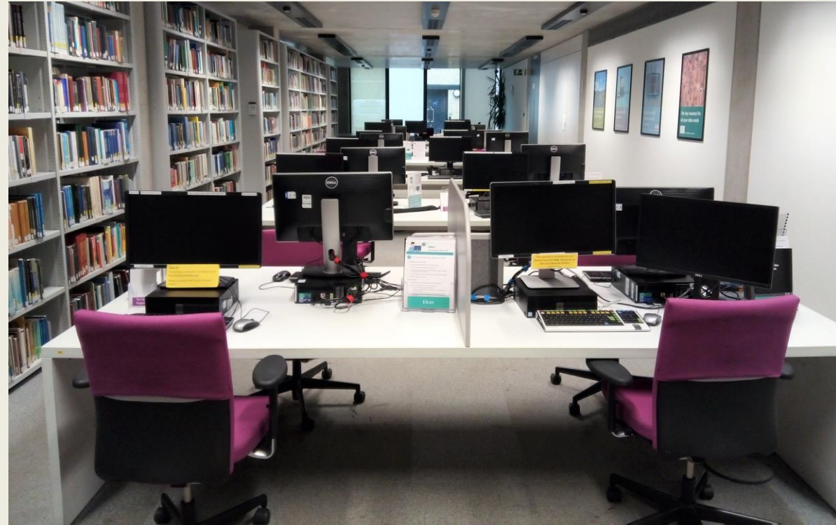
Legal Deposit on reading room shelves; eLD via Bodleian Libraries PCs