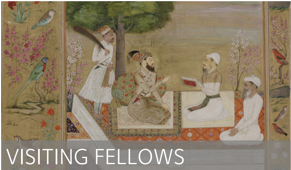
MS. Douce Or. a.1, fol. 56r