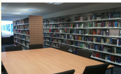
New Book Collection Room - Cairns Library

The summer of 2012 saw refurbishments and improvements to the space in the Cairns Library and Knowledge Centre. The Knowledge Centre underwent a change of layout including a new Group Study Room. The Cairns Library benefitted from a new Book Collection room, improved study spaces and desks, and a new carpet. As usual with these projects they didn't run entirely to schedule, but the patience of our users was rewarded with much more pleasant spaces to work and study!