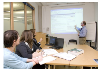
Group Study Room - Knowledge Centre