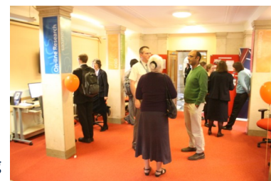
Hive launch reception

www.bodleian.ox.ac.uk/science/services/areas/the-hive