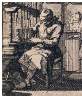
Jan and Kasper Luiken, Spiegel van't menschelyk bedryf (Amsterdam, c.1700), plate 63 De Boeckbinder (The Bookbinder)