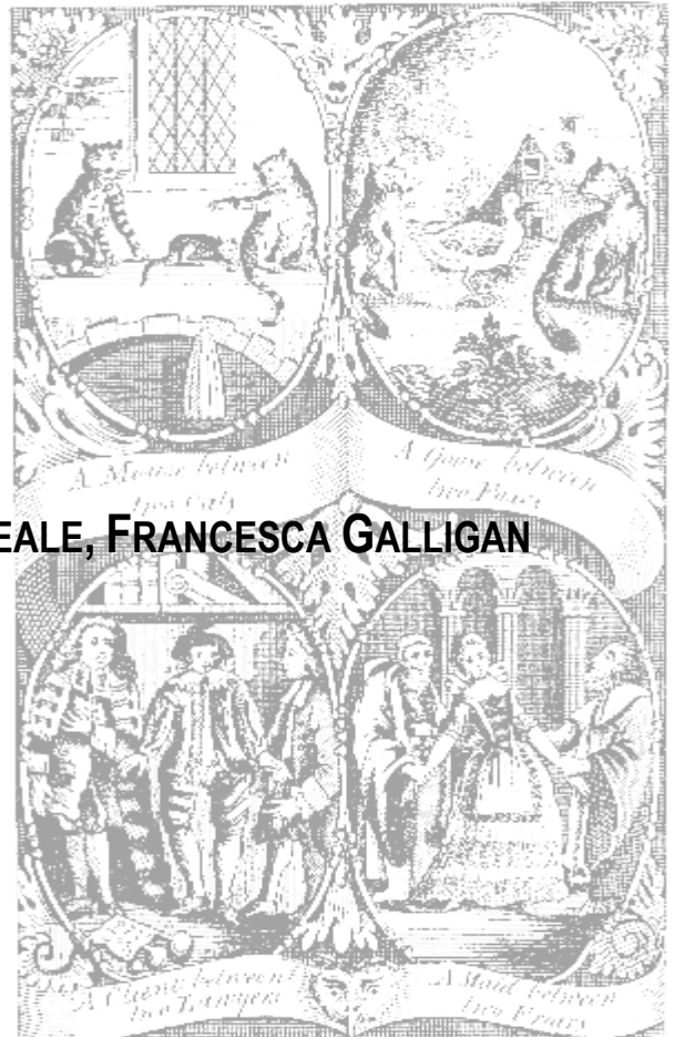
A Mouse between two Cats